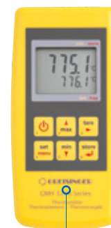
Handheld measuring devices for temperature detection