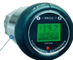
Temperature transmitters and switches